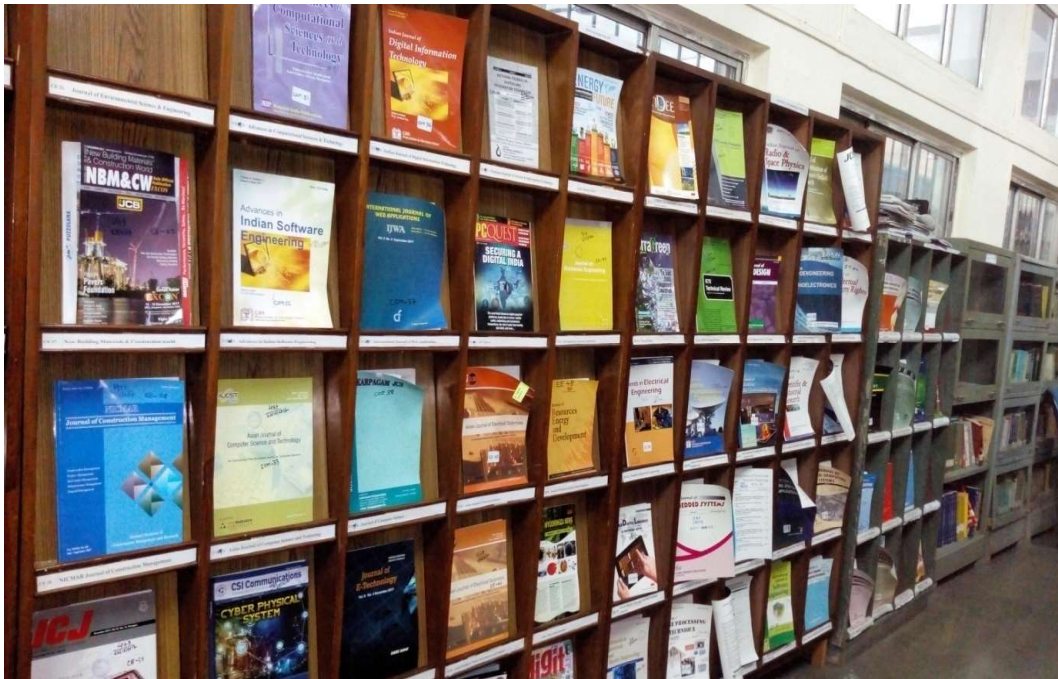
Figure 1 : Display of Current Periodicals in the Library