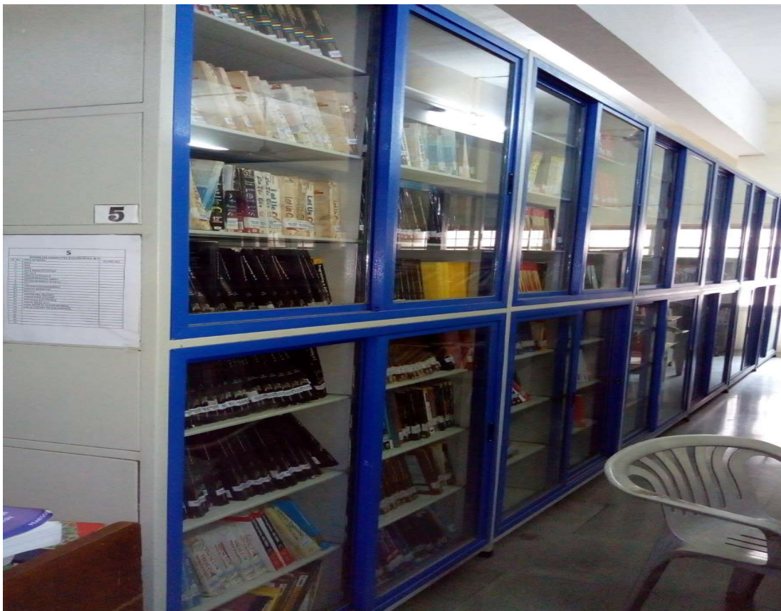
Figure 3 : Racks for Books in the Library