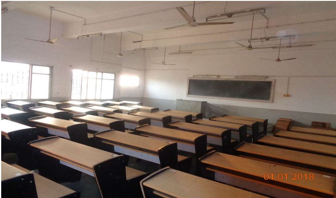
Figure 1 : Classroom for conducting theory classes

The institution has sufficient number of well-furnished, well ventilated, spacious classrooms for conducting theory classes.