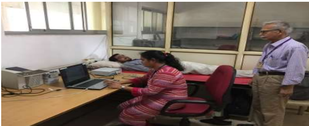
Figure 4 : Biomedical Engineering Research Laboratory