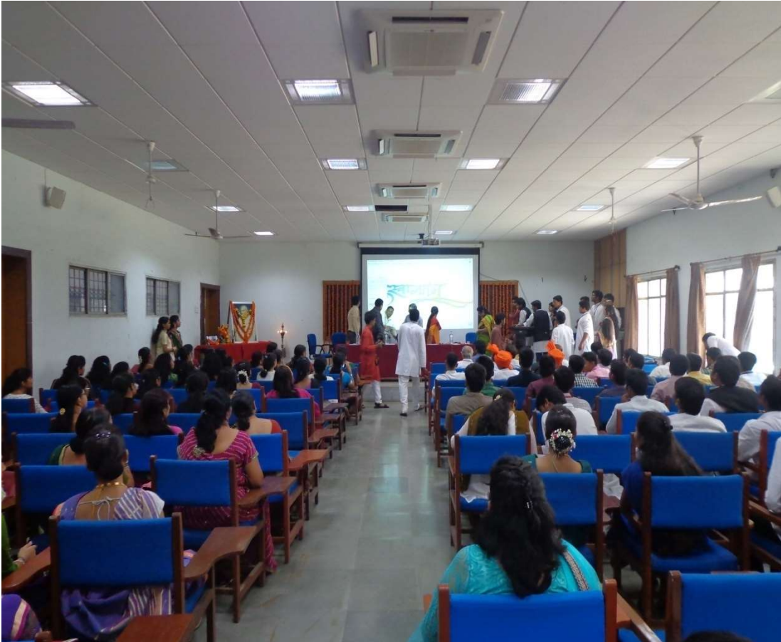
Figure 6 : Seminar Hall