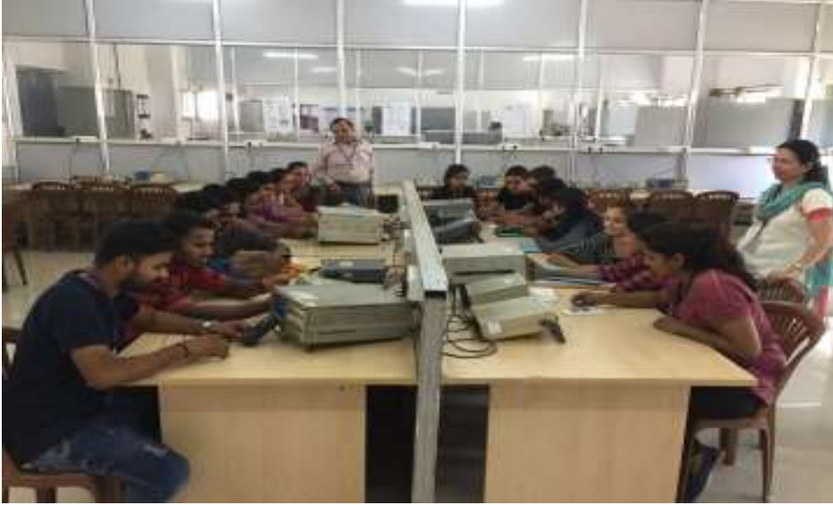
Figure 2 : Medical Electronics Laboratory