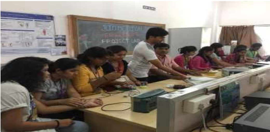
Figure 3 : Projects Laboratory